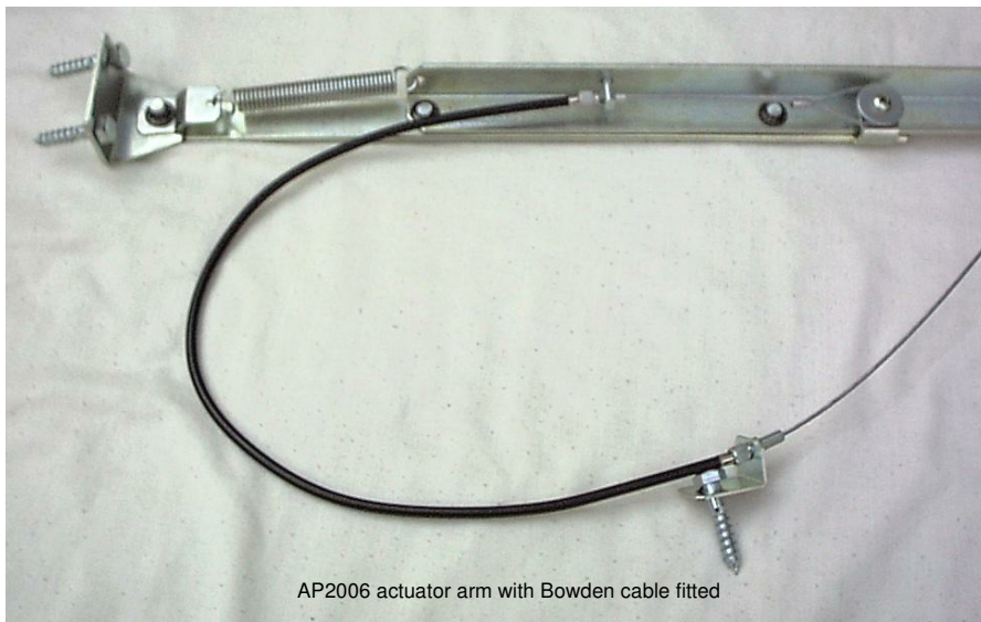
AP2006 actuator arm with Bowden cable fitted

For use with side hinged door operating arms type AP2006 only