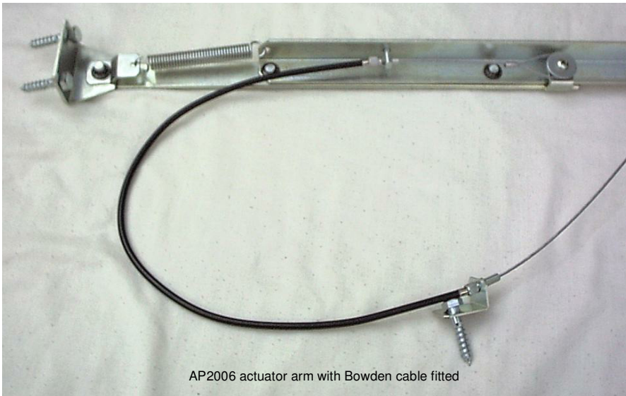
AP2006 actuator arm with Bowden cable fitted

For use with side hinged door operating arms type AP2006 only